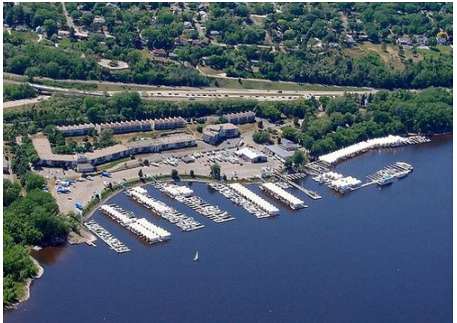
Minnesota marina on the Saint Croix River