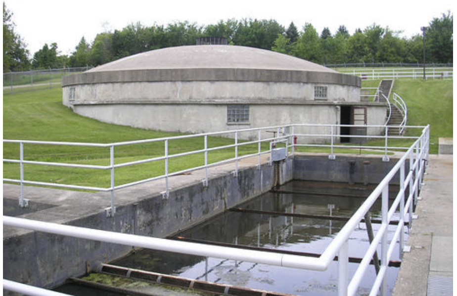
outside of a wastewater facility

EPA Treatment Works Fact Sheet ( http://www.epa.gov/npdes/pubs/sector_t_treatmentworks.pdf )