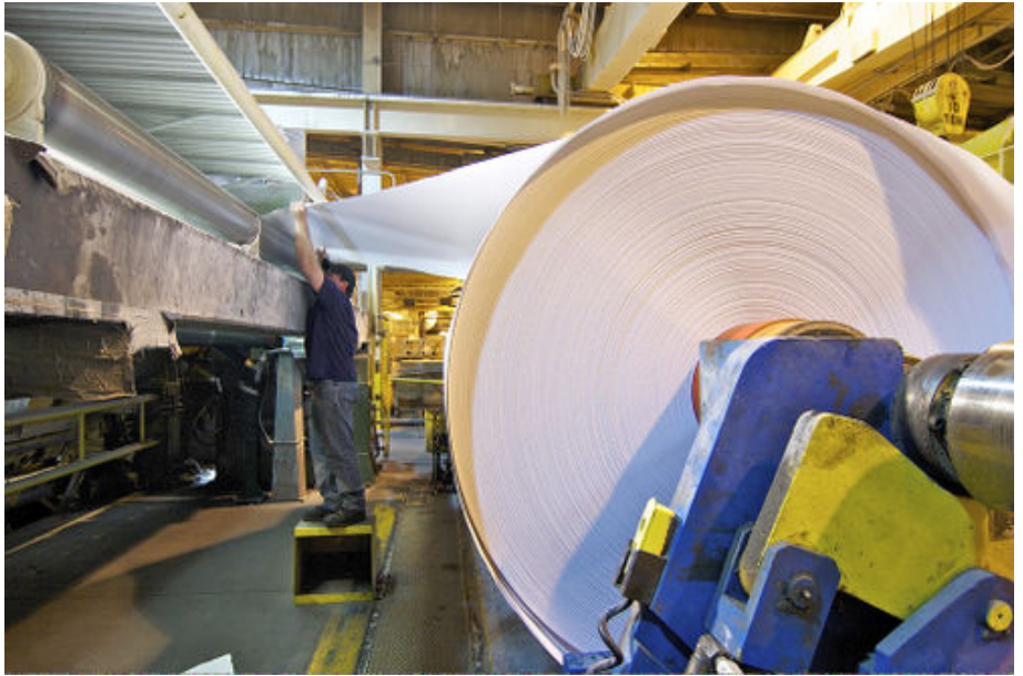
Manufacturing paper products at a Minnesota company.

EPA Pollutants and Control Measures Fact Sheet EPA Paper and Allied Products Manufacturing fact sheet ( http://www.epa.gov/npdes/pubs/sector_b_paper.pdf )