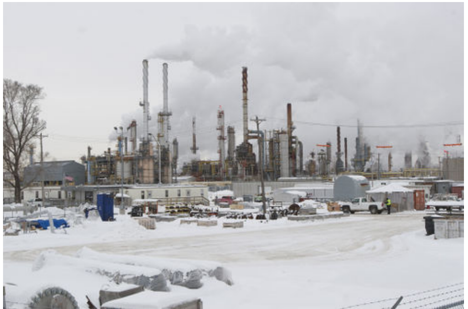
Minnesota oil refinery in the winter time.