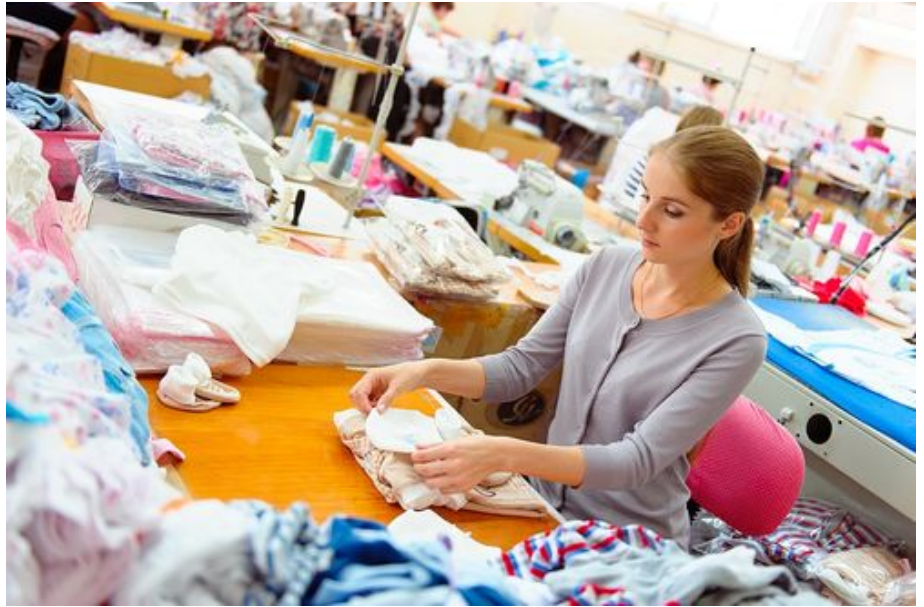
Clothing manufacturer making baby clothes

MPCA Textile Mills, Apparel, and Other Fabric Products Sector-Specific Permit Requirements ( https://www.pca.state.mn.us/sites/default/files/wq-strm3-67a22.pdf )