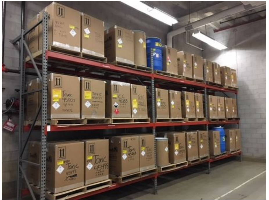
Hazardous waste barrels at the University of Minnesota's hazardous waste disposal facility.