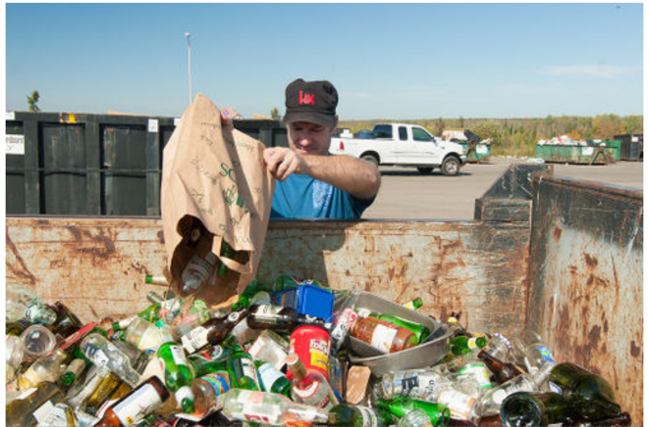
Recycling keeps materials out of the landfill, saves money, and provides jobs for a growing industry.