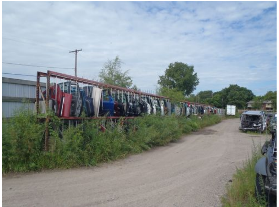
A clean yard helps facilities work more efficiently