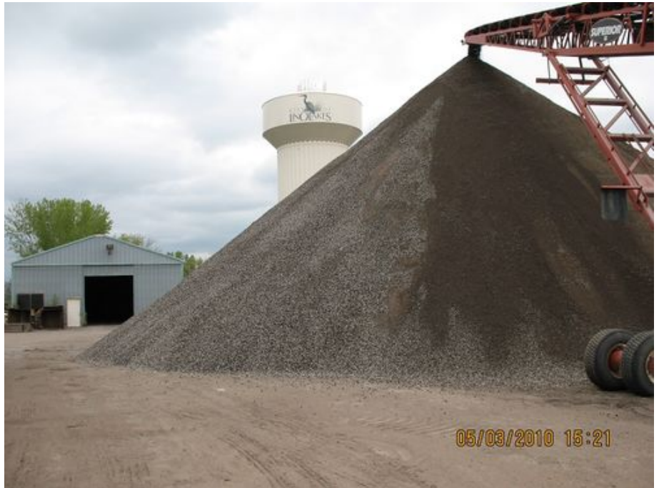
Recycled asphalt, to be used for future asphalt manufacturing.

EPA fact sheet - Asphalt paving and roofing materials manufacturers and lubricant manufacturers ( http://www.epa.gov/npdes/pubs/sector_d_asphalt.pdf )