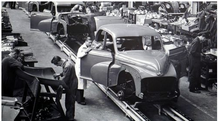
Automobile manufacturing in the mid-1900's.

MPCA Transportation Equipment and Industrial or Commercial Machinery Manufacturing Sector-Specific