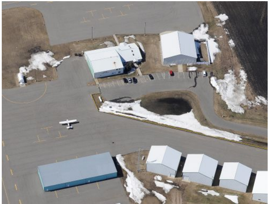
Municipal airport in Minnesota in the winter.