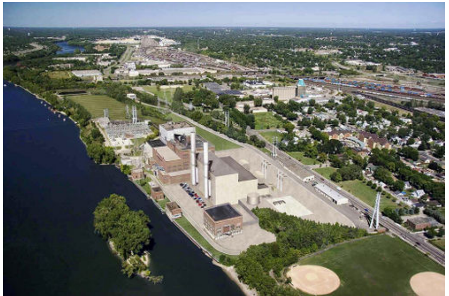
Minnesota energy company along the Mississippi River