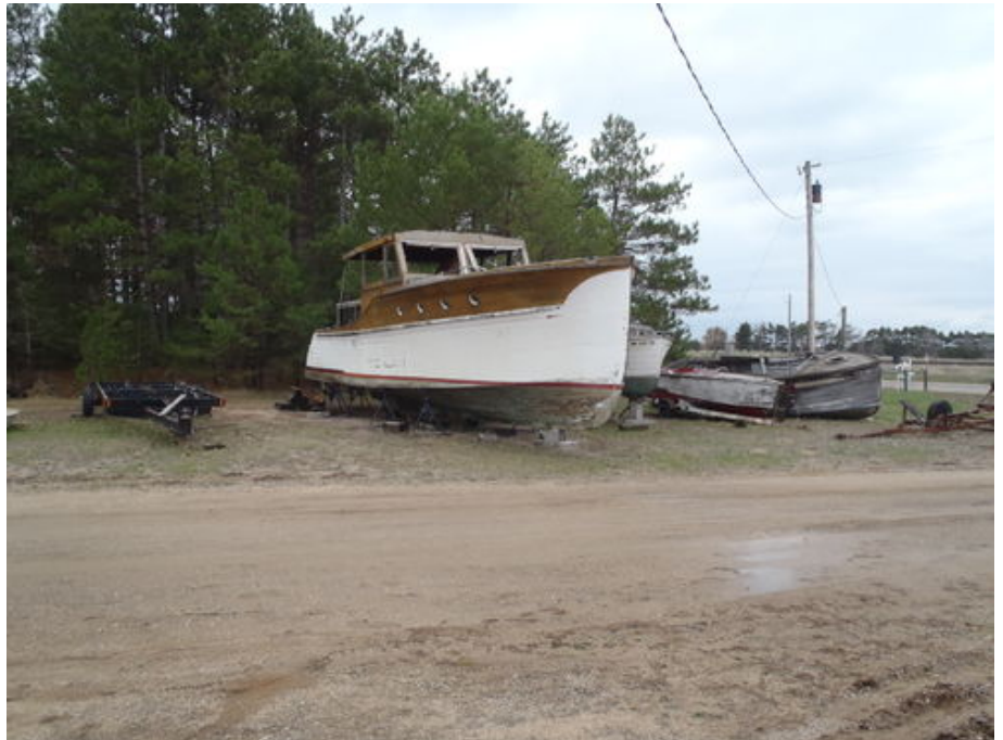
Boats awaiting repair at a Minnesota boat repair company