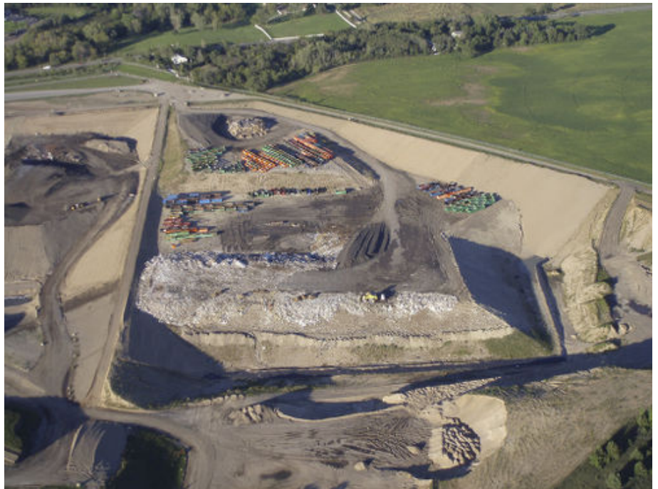
A Minnesota landfill