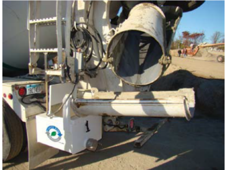
Recover and recycle concrete mixing wash water back into the truck.

Do you have multiple facility locations? Consider getting the multi-site "Nonmetallic mining and associated activities" NPDES/SDS general permit ( https://www.pca.state.mn.us/sites/default/files/wq-wwprm7-33a.pdf ) instead. There are five basic steps for complying with these requirements: