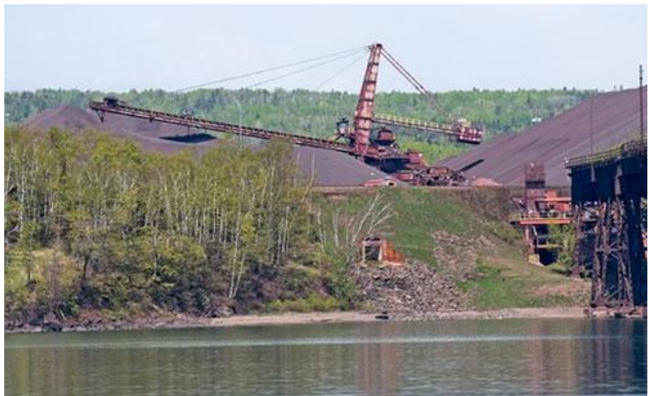
Minnesota metal mining facility

MPCA Metal Mining (Ore Mining and Dressing) Sector-Specific Permit Requirements ( https://www.pca.state.mn.us/sites/default/files/wq-strm3-67a7.pdf )