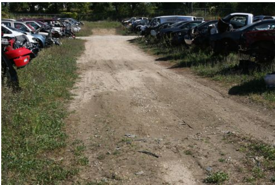
A well-maintained auto salvage yard not only protects the environment, it saves a company time and money!

MPCA Automobile Salvage Yards Sector-Specific Permit Requirements ( https://www.pca.state.mn.us/sites/default/files/wq-strm3-67a13.pdf )