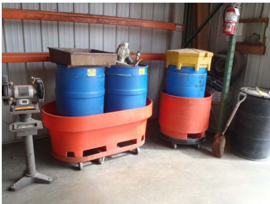
Indoor storage of waste and materials are one of the best stormwater practices