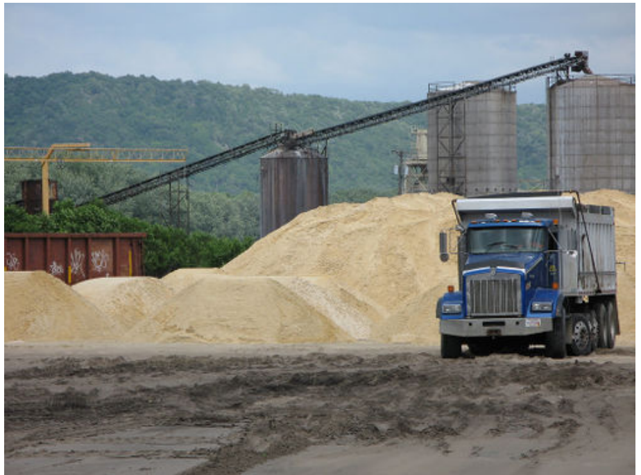
Minnesota sand mining facility

For more information, visit the Nonmetallic mining general permit website ( https://www.pca.state.mn.us/quick-links/nonmetallic-mining-and-associated-activities ).