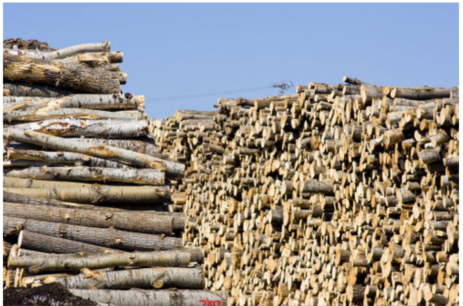
Harvested trees in Minnesota

MPCA Timber Industries Sector-Specific Permit Requirements ( https://www.pca.state.mn.us/sites/default/files/wq-strm3-67a1.pdf )