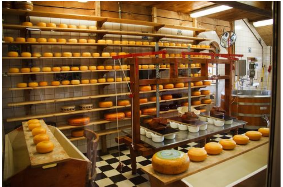
A small cheese factory