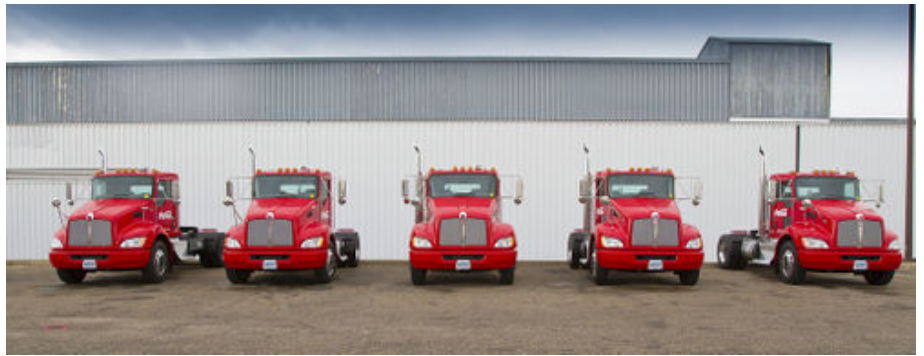
Trucking company in Minnesota