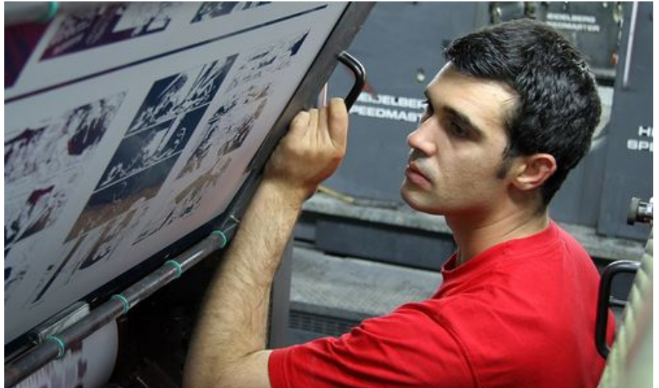
The printing industry has changed more than any other industry; most facilities can qualify for the No Exposure exclusion.

MPCA Printing and Publishing Sector-Specific Permit Requirements ( https://www.pca.state.mn.us/sites/default/files/wq-strm3-67a24.pdf )