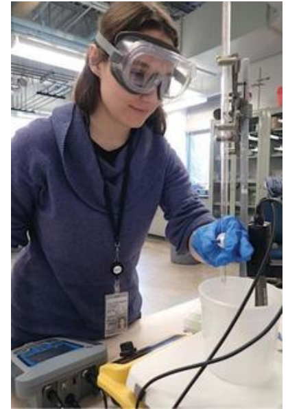
Chemical manufacturing facility staff