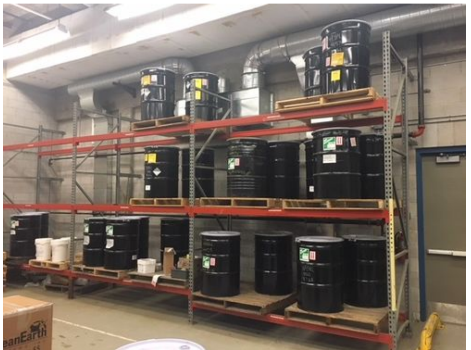
Hazardous waste containers at the University of Minnesota's hazardous waste disposal facility.