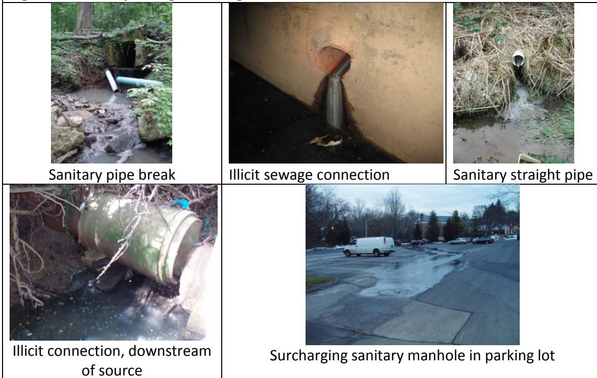
Figure 7. Sanitary sewage discharge sources