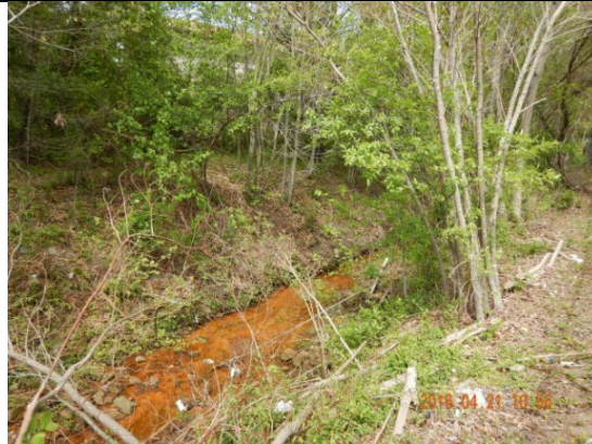
Iron floc in a stream