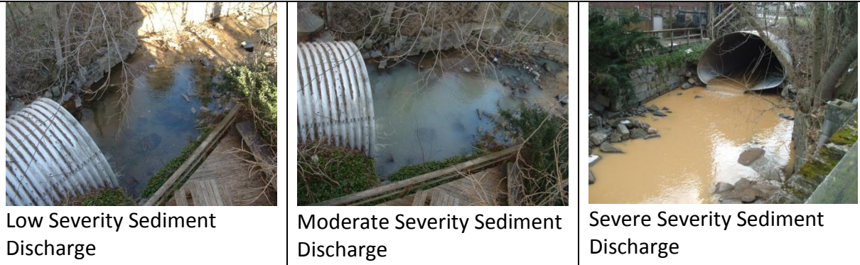
Figure 1. Sediment Discharge (Examples)

Sediment discharges usually originate on the landscape and look like the examples shown in Figure 2 .