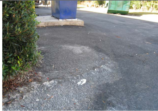
High Severity Waste Management – Grease accumulation on lot draining to storm drain