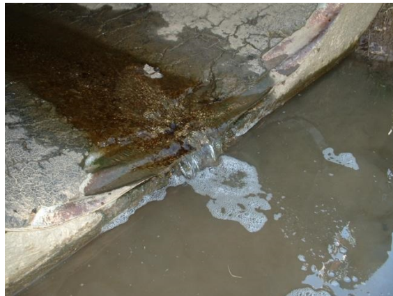
Low Severity Suds – Score: 1 Note: Suds do not appear to travel; very thin foam layer