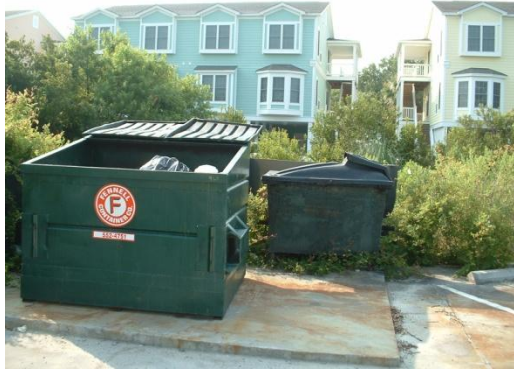
Low Severity Waste Management – Open dumpster with visible staining