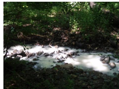
Turbidity Severity: 3