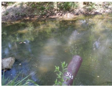
Turbidity Severity: 2