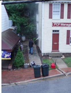
Low Severity Washing – Individual power washing building side without soap