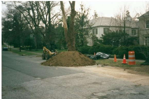
Soil piled on the street