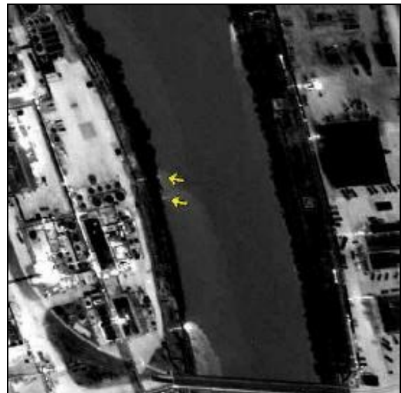
Figure 18: Four discharges to the river appear as white plumes. The two discharges highlighted with arrows were unknown discharges.