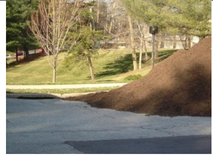
High Severity Yard Waste Management – Pile of mulch in street next to storm drain