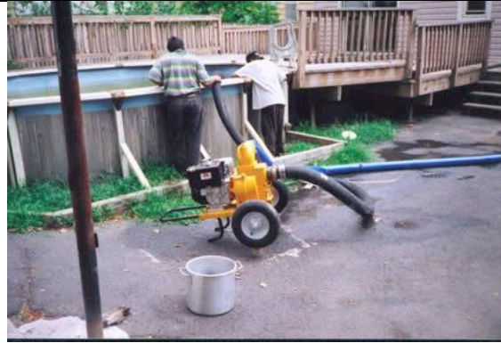
Figure 8. Suspect pool discharge