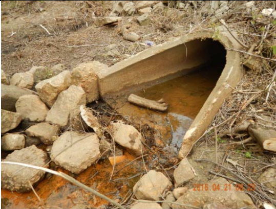
Iron floc in an outfall pipe