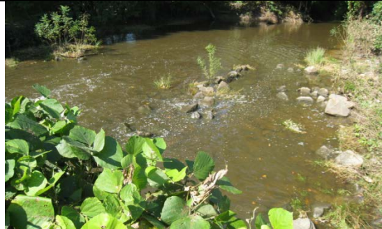
Moderate Severity – Suds persisting below outfall