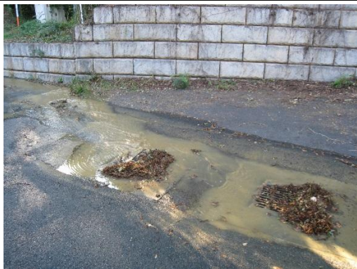
Construction site runoff