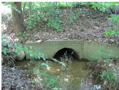
Turbidity Severity: 1