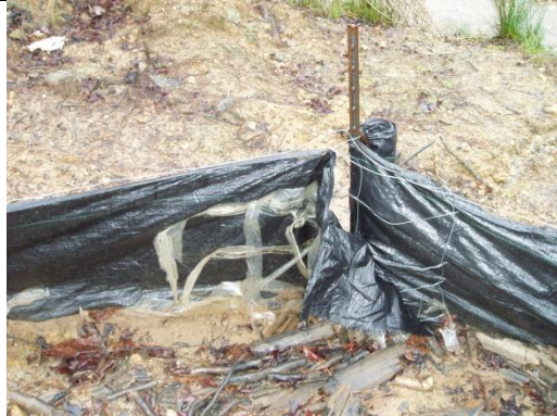
Failing silt fence