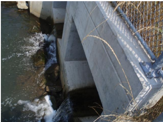
Natural Foam - Do not record. Note: Suds caused by turbulence