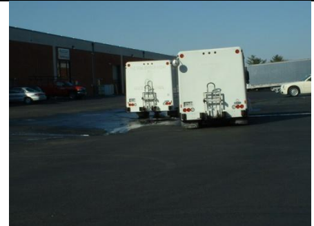
High Severity – Fleet vehicle washing next to storm drain