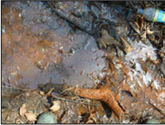
Sheen from bacteria such as iron floc forms a sheet-like film that cracks if disturbed