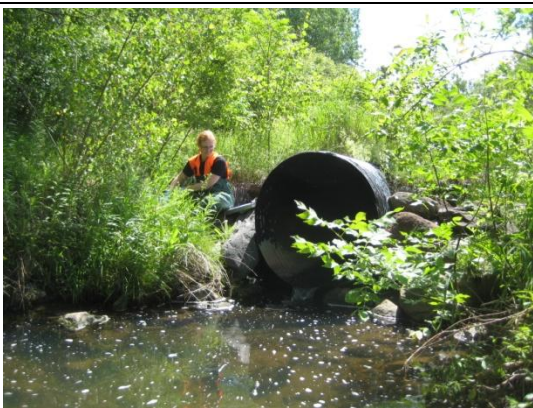
Moderate severity suds – Score: 2