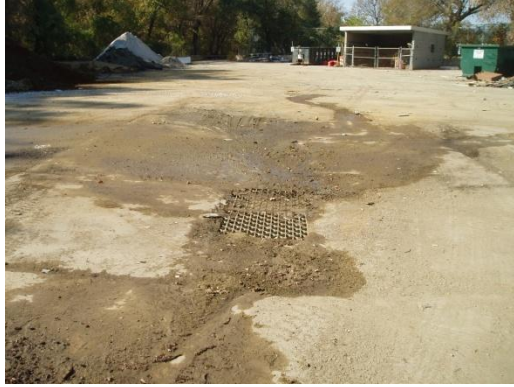
Unprotected storm drain inlet