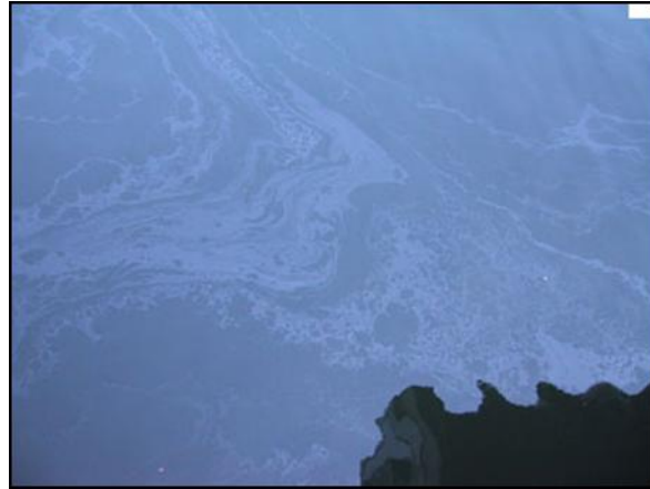
Synthetic oil forms a swirling pattern