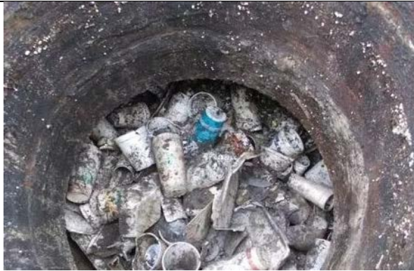
High Severity Waste Management – Trash clogging storm drain manhole.