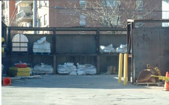
Low Severity Chemicals Management – Miscellaneous waste stored outside, some under cover.