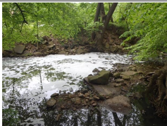
High severity suds – Score: 3