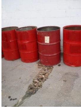
High Severity Chemicals Management – Uncovered, unlabeled leaking barrels