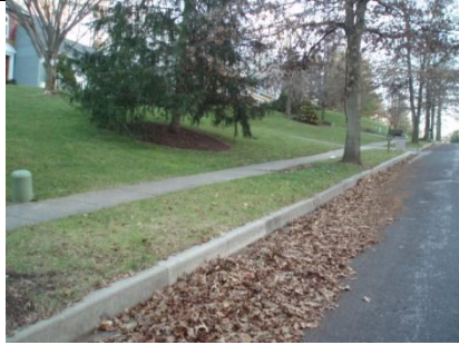
Low Severity Yard Waste Management – Leaves accumulating in street gutter