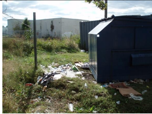
Moderate Severity Waste Management – Poorly managed dumpster and/or dumping