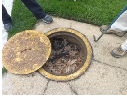
Moderate Severity Yard Waste Management – Clogged storm drain