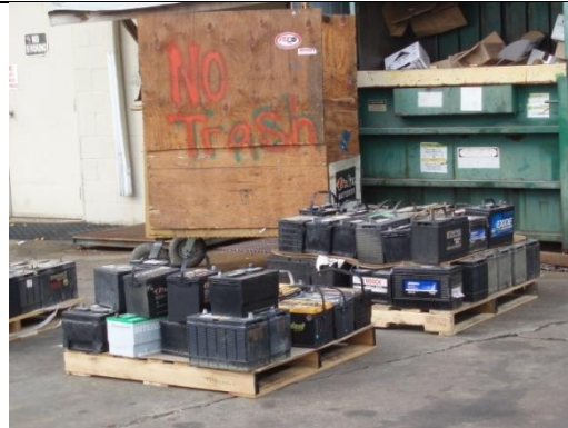
Moderate Severity Chemicals Management – Batteries outside without cover, on pallets