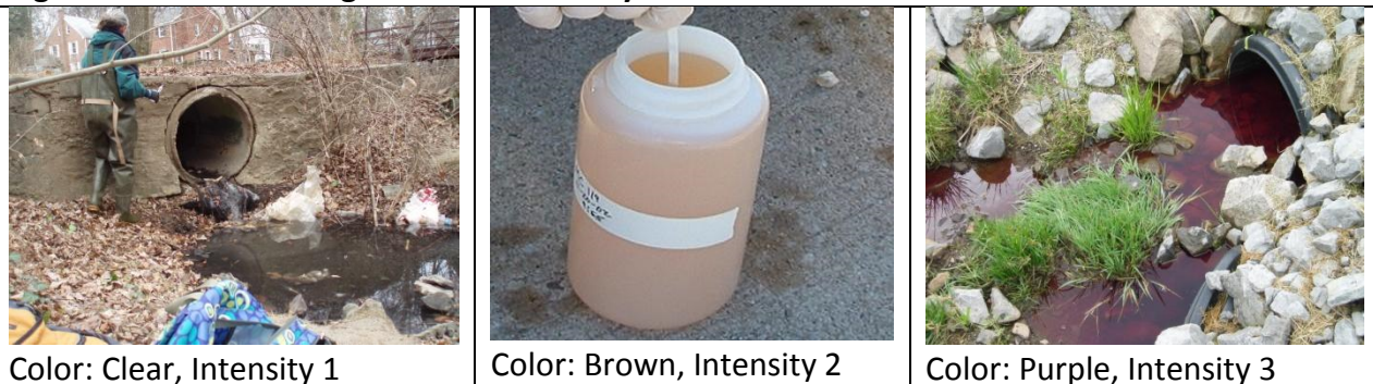
Figure 12. Illicit discharge colors & intensity