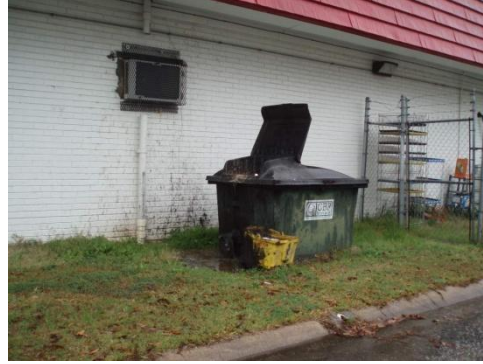
High Severity Chemicals Management – Used oil container open with spills